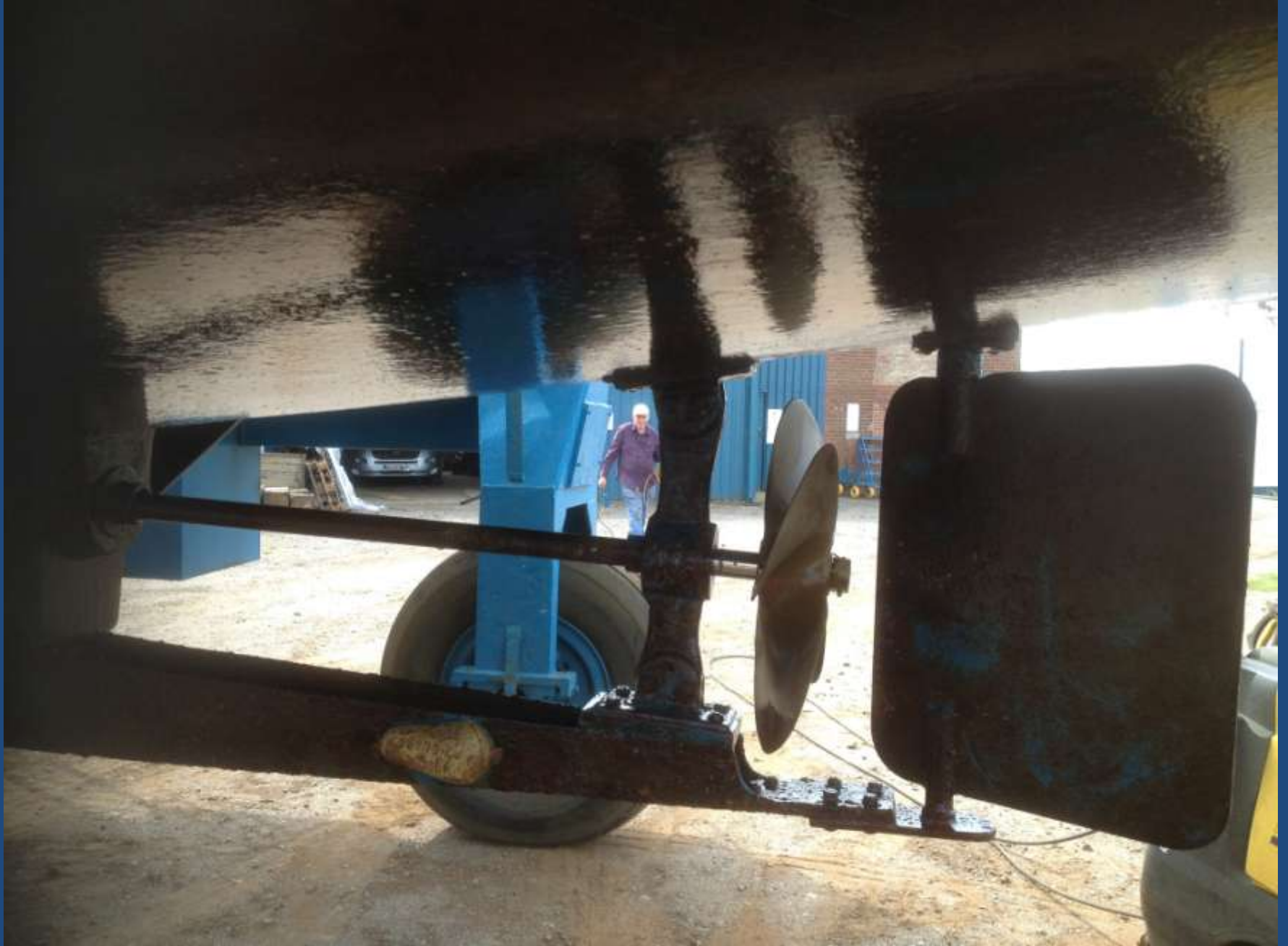
The Propeller And Anode Looks Good