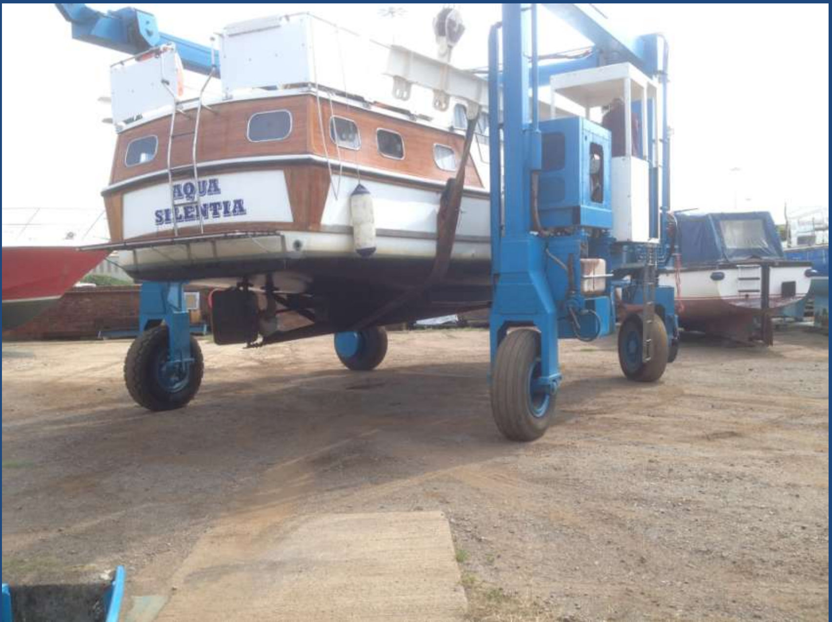
Moving The Aqua To The Cleaning Bay