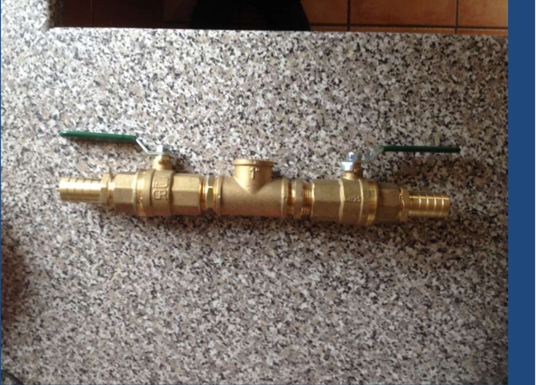
Isolation Valves For Raw Water Filters