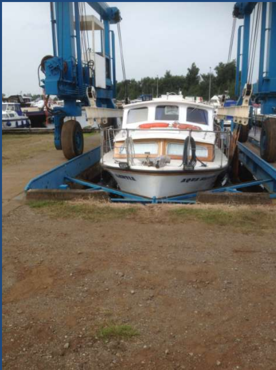
Taking The Strain