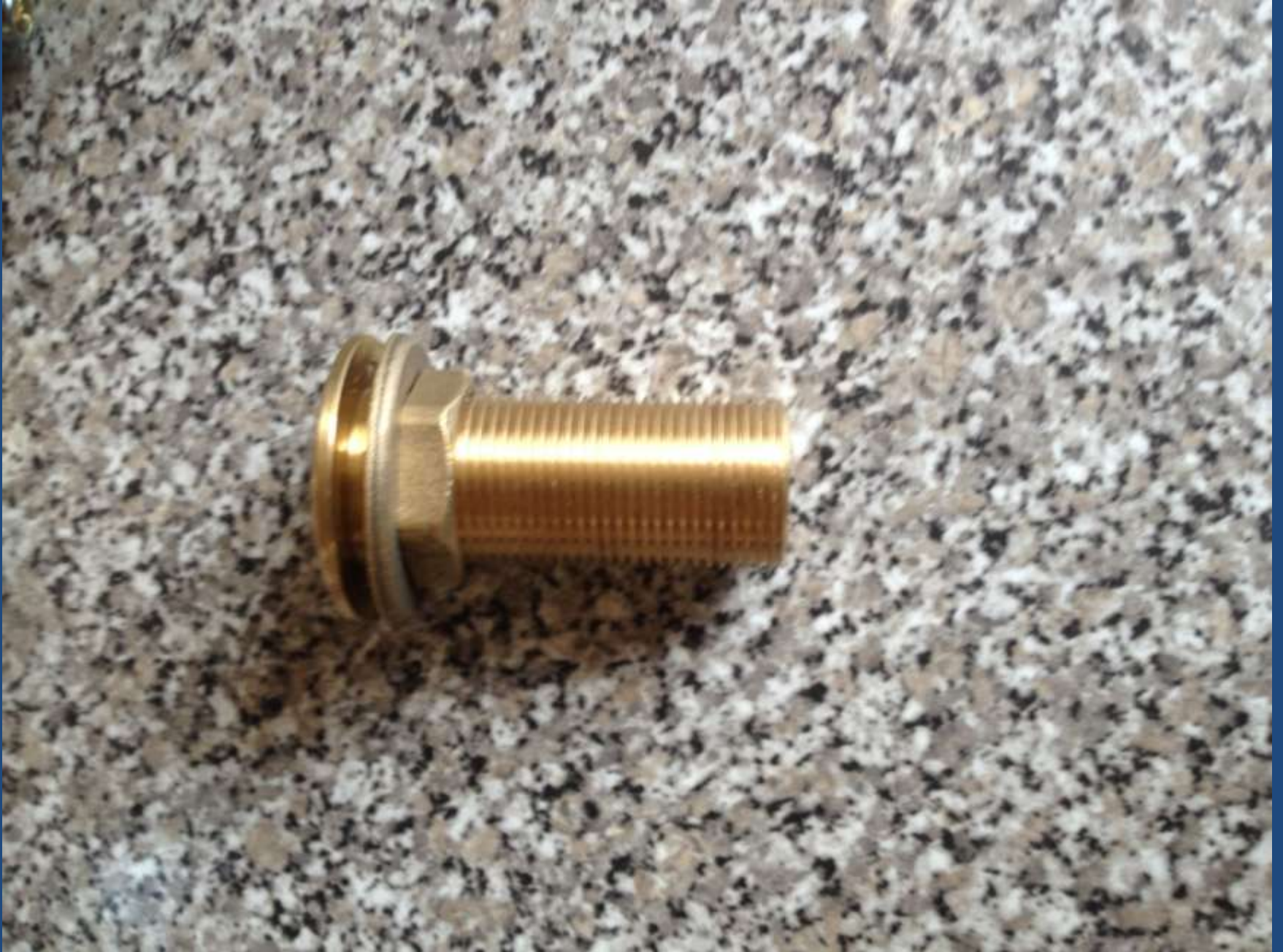
Hull Fitting For New Raw Water Filter