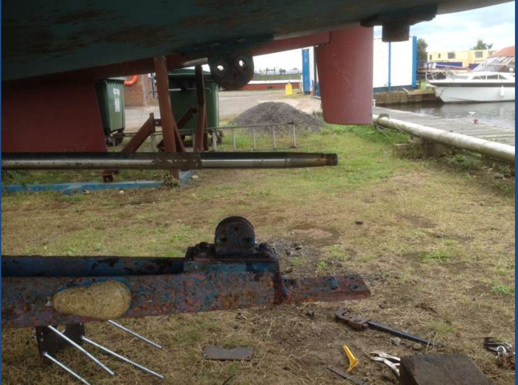
Pee Bracket Removed Taken To Peter