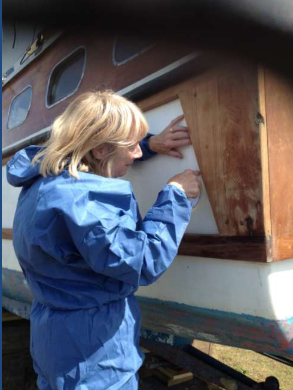
Masking Tape And Varnishing