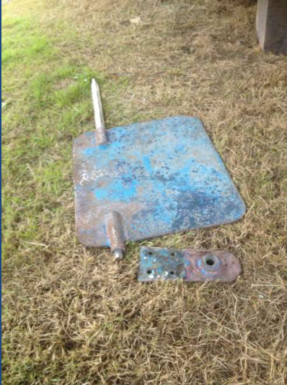
Rudder Removed Looks Good