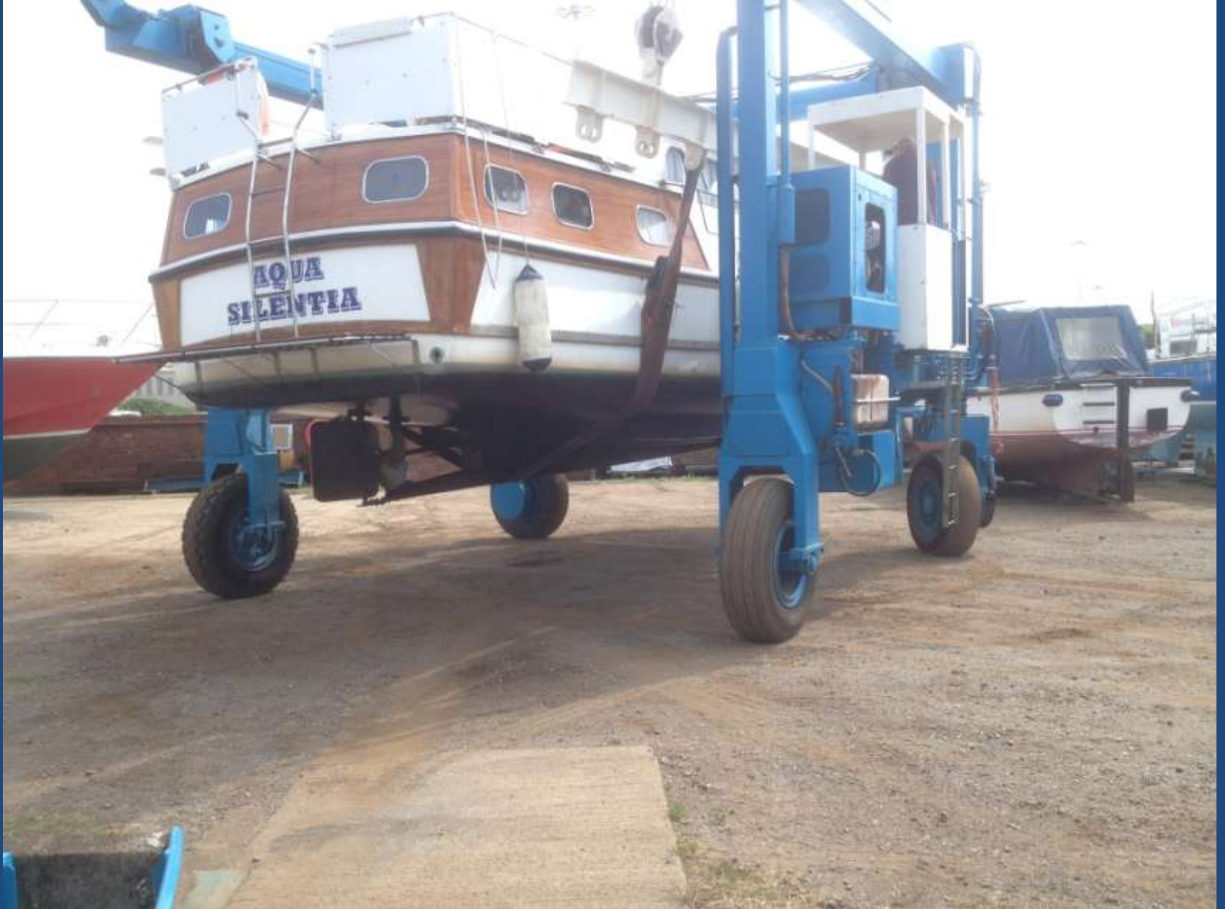
The Aqua With A Dirty Bottom