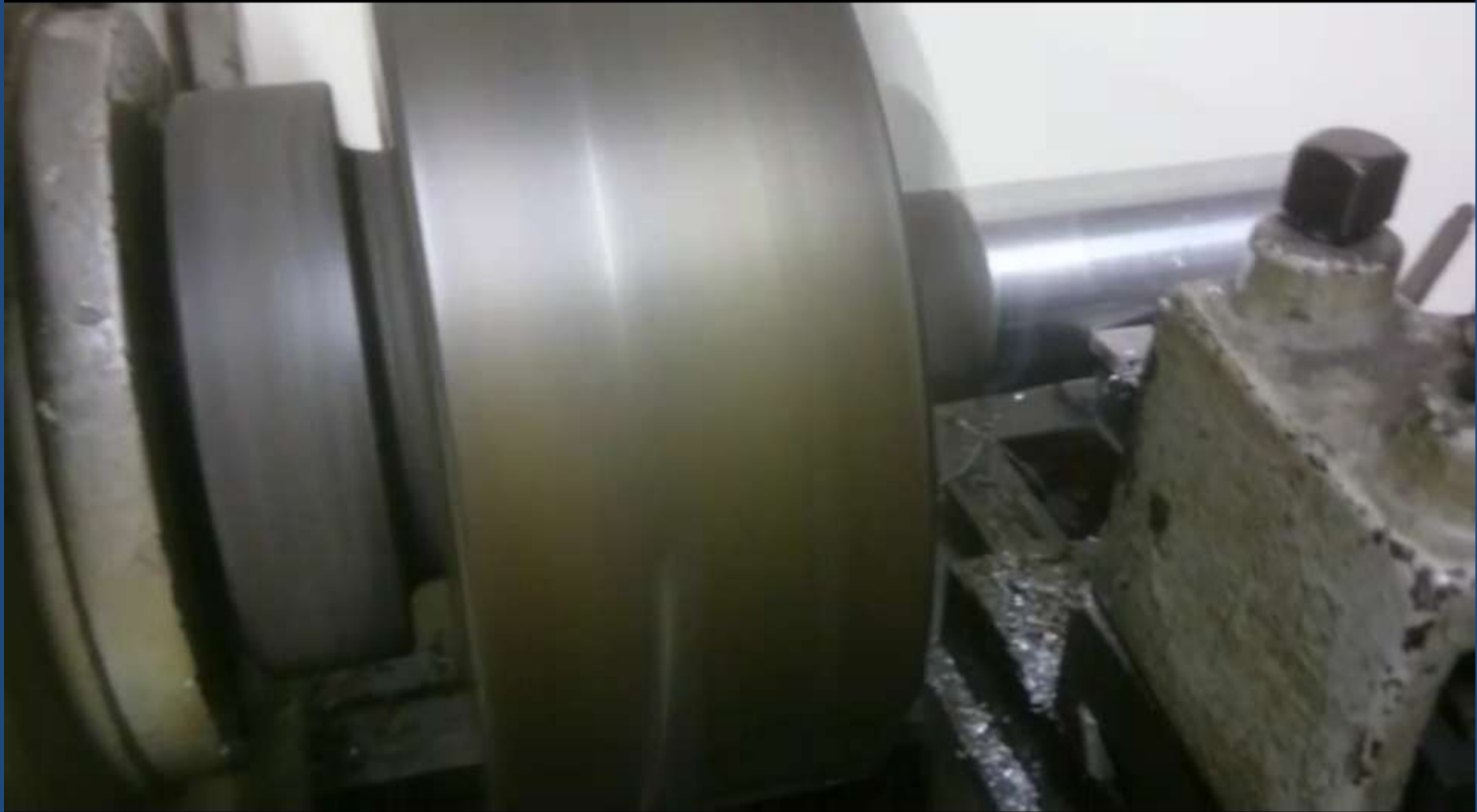
Ian Making The Cutlass Removal Tool