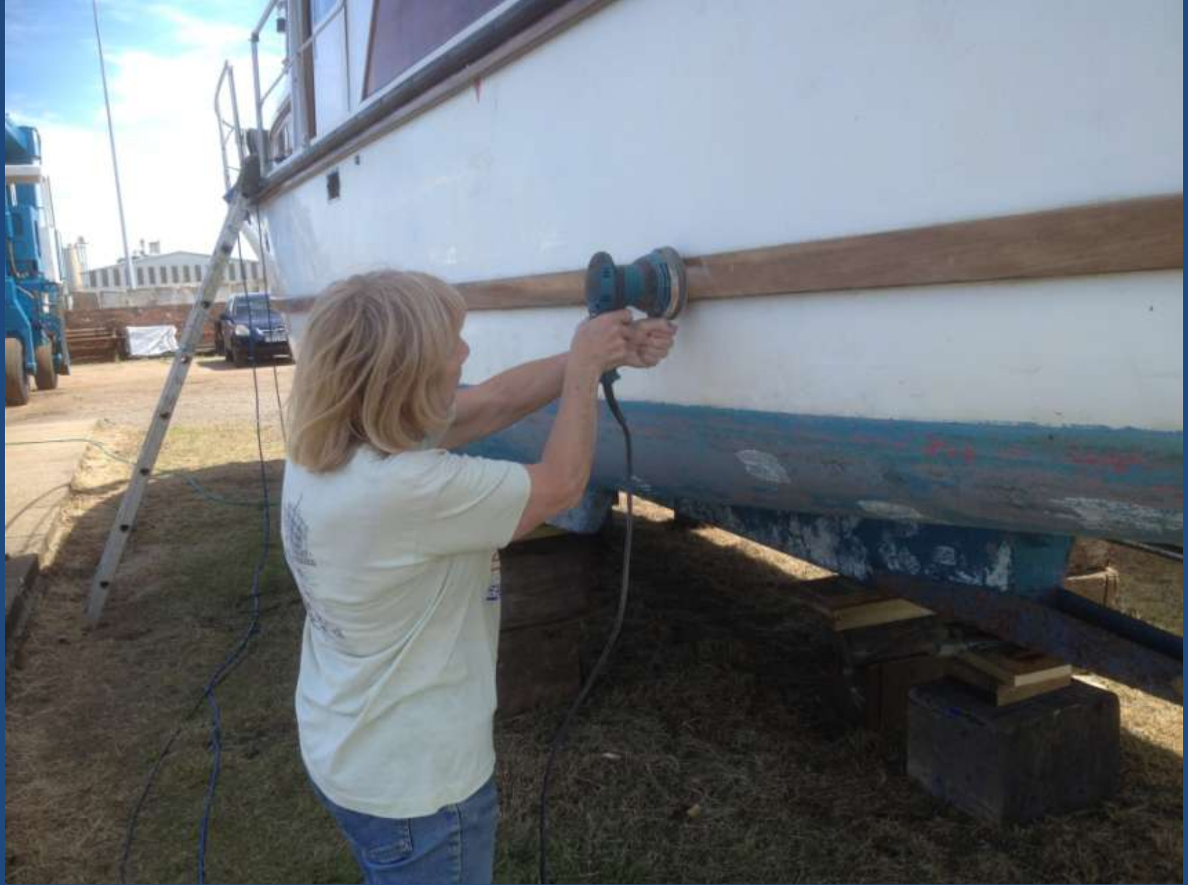
Woodwork Sanding Underway