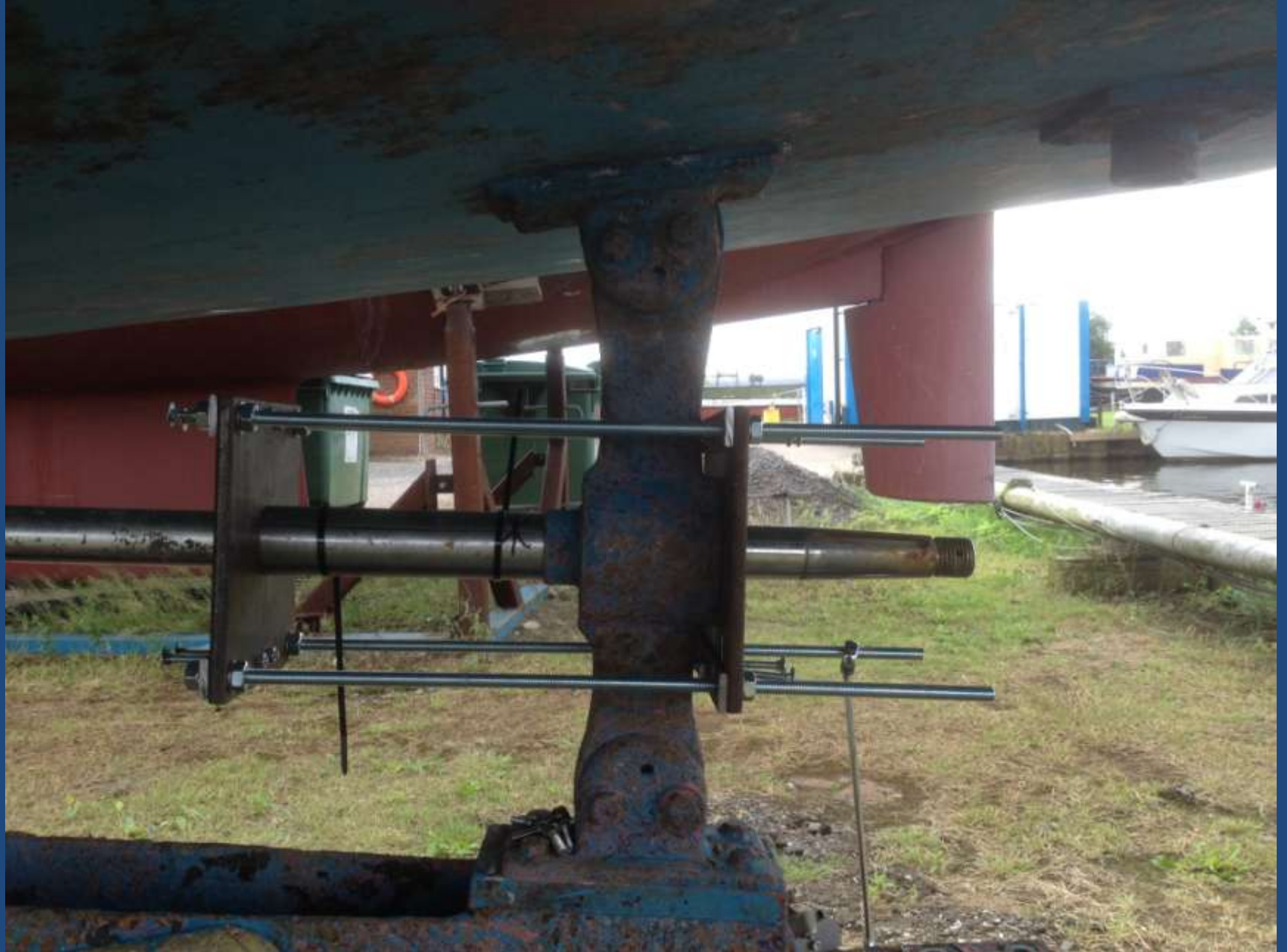
Cutlass Bearing Removal Failure