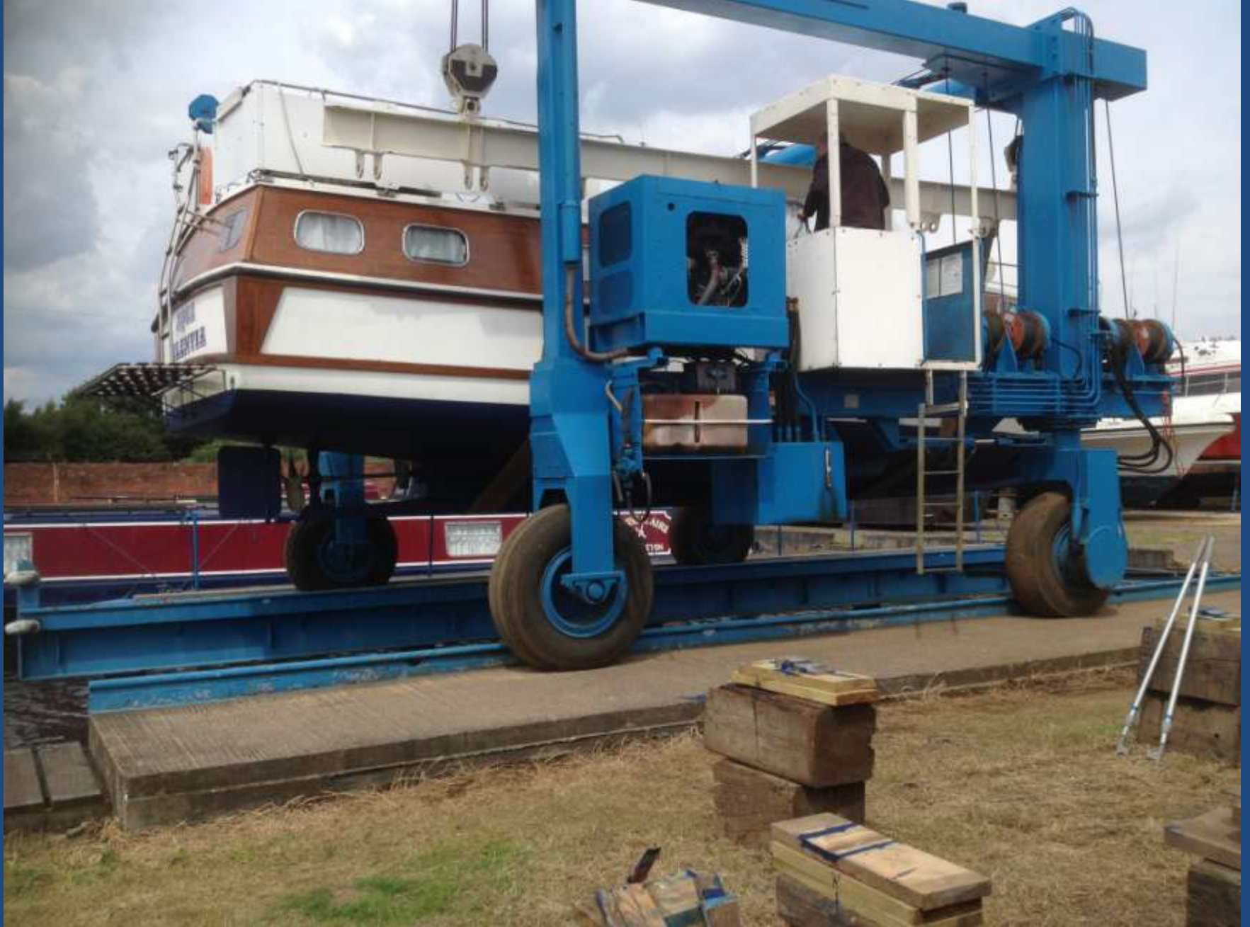
Take It Steady John